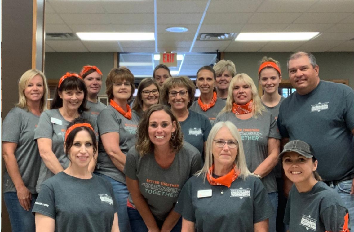
Spearfish First Interstate Bank Employees on Volunteer Day