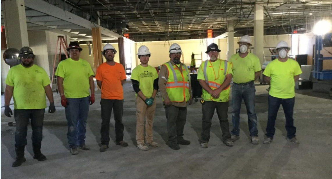
The Ainsworth-Benning Team Onsite the BHSU Library Project

Aside from working on various community-enhancing construction projects, Ainsworth-Benning Construction gives back to the community by sponsoring several non-profit initiatives each year. For example, the company began participating in the City of Spearfish Adopt-a-Park program this year by adopting Jorgensen Park.